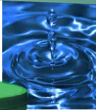
Improves water quality