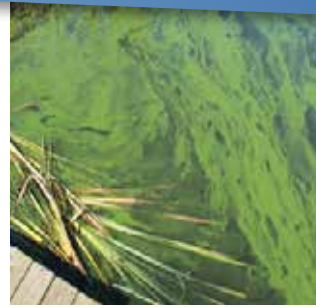
Quick activation within days