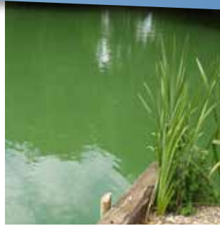
Natural & safe