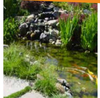
Environmentally-safe: Fish-friendly with its non-toxic composition