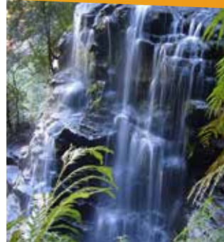
A Fresh Start: Bid farewell to decaying organic matter from rocks and waterfalls