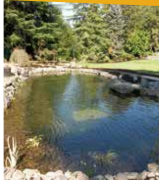
Precision in Action: Takes on scum build-up along pond edges