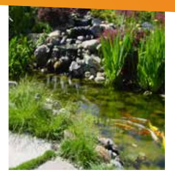
Environmentally-safe: Fish-friendly with its non-toxic composition