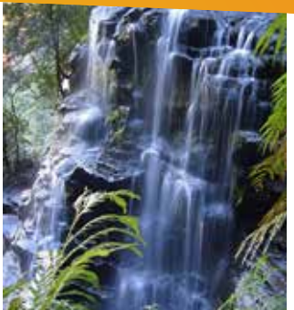
A Fresh Start: Bid farewell to decaying organic matter from rocks and waterfalls