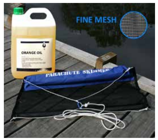
Use in conjunction with our Orange Oil solution.