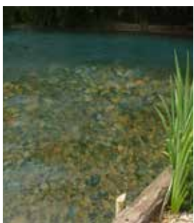
Do not use more Coptrol than as directed