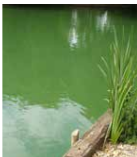
Check your water hardness when fish are present