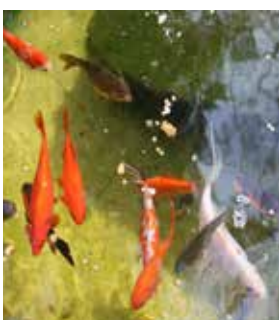
Spray into the edges to avoid trapping fish