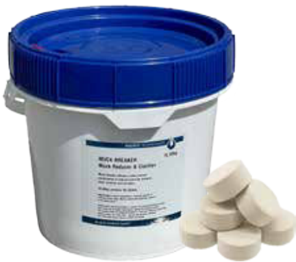
10.88kg (96 tablets)