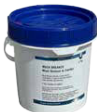
2.7kg (24 tablets)