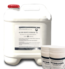
20L AQ200 + 2x250g Hydrogel

For more information visit WWW.AQUATICTECHNOLOGIES.COM.AU