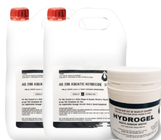
2x5L AQ200 + 250g Hydrogel