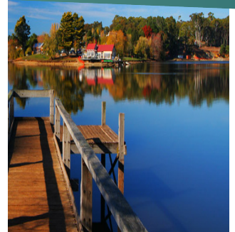
Lake dye for aesthetics