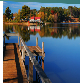
Lake dye for aesthetics