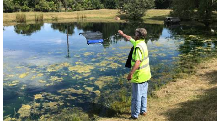
STEP 2 - Standing on the very end of cord, toss out the skimmer.