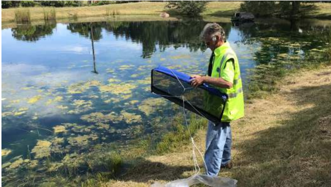
STEP 1 - Unpack skimmer & unfurl 10m cord.