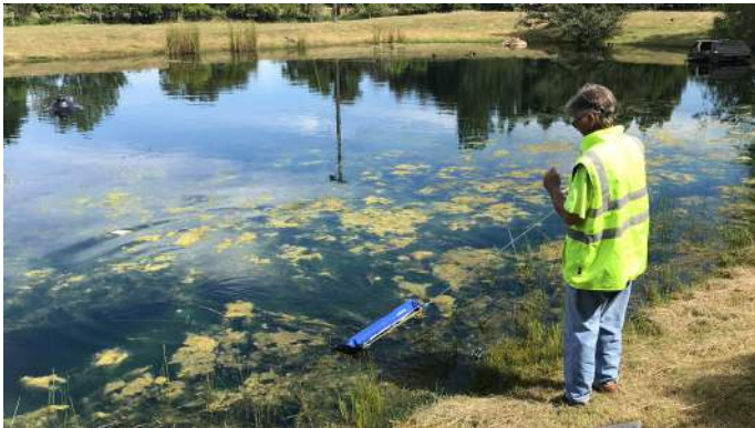
STEP 3 - Slowly drag the skimmer back to shore.