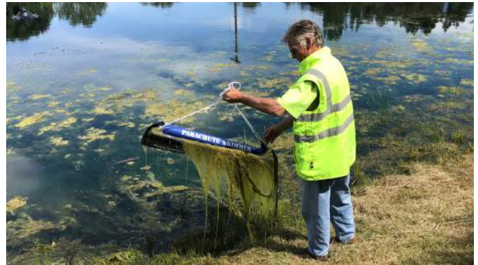
STEP 4 - Clear away retrieved algae.

WHAT IS ALGAE? Algae is quick growing and can be potentially harmful to water quality. The ALGAE SKIMMER is a safe way of removing unsightly algae. A common algae found in Australian dams is: