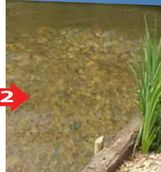
2. It clears water by flocculating sediment particles.