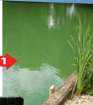
1. It coagulates microalgae.