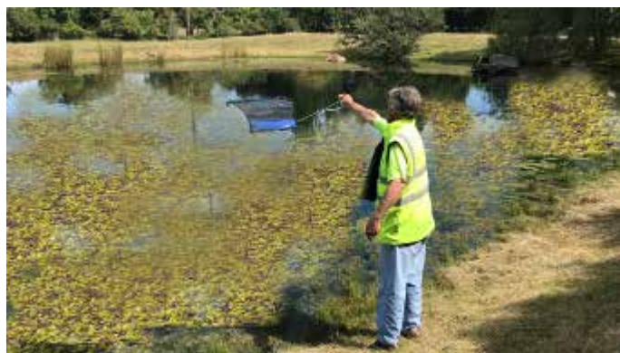
STEP 2 - Hold the very end of cord, toss out the skimmer.