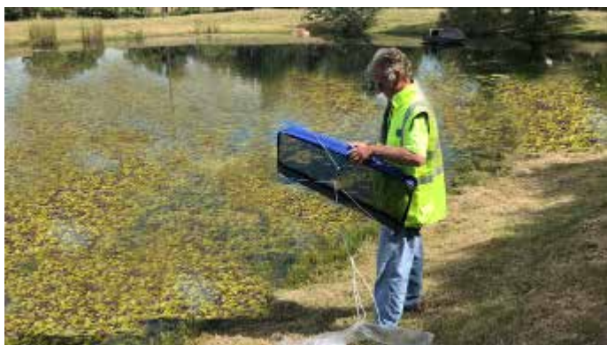
STEP 1 - Unpack skimmer & unfurl 10m cord.