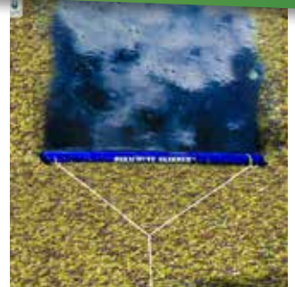
Large salvinia infestations