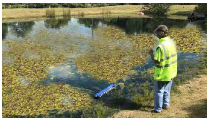
STEP 3 - Slowly drag the skimmer back to shore.