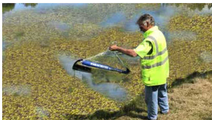
STEP 4 - Clear away collected weeds.

Perfect for ponds, dams and lakes, this handy skimmer clears a path in your water by skimming free-floating surface aquatic weeds and vegetation.